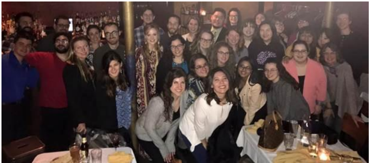
Pictured here: Molloy Music Therapy students, alumni, and faculty

Wonderful representation and a job well done to all!